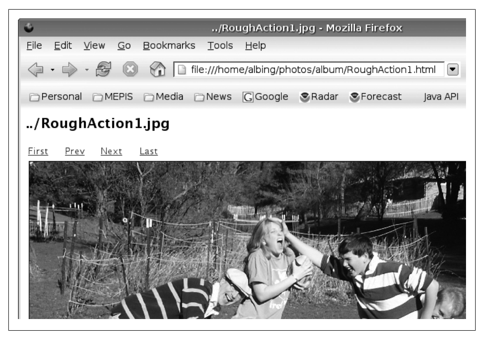
Figure 12-1. Sample mkalbum web page